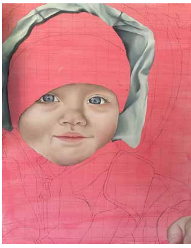
"Oil Painting - work in progress 18 x 22 inches"

The success within public exhibitions and my awarded grade for this fine art-based project led me to making the decision of studying Fine Art at degree level and being offered an