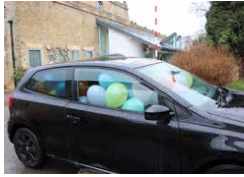
Guess the number of balloons in the car