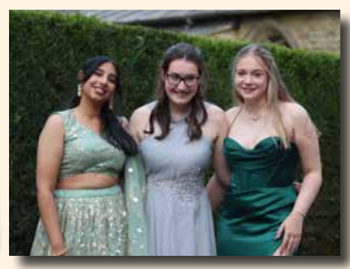
Leavers' Service – July 2023