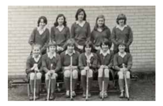
U14/15 Hockey Team - 1980/1981